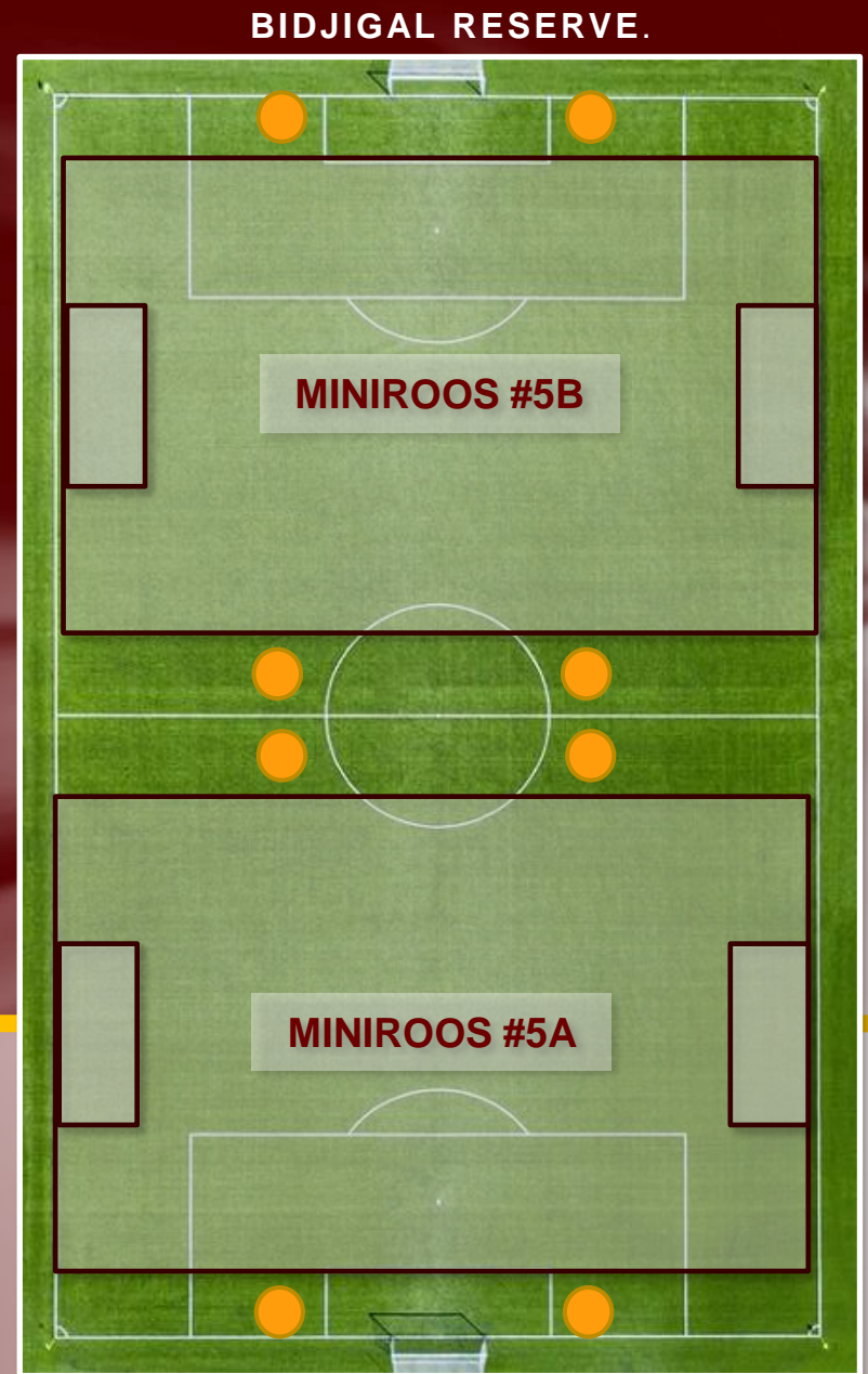
CAR PARK END OF TH #5.